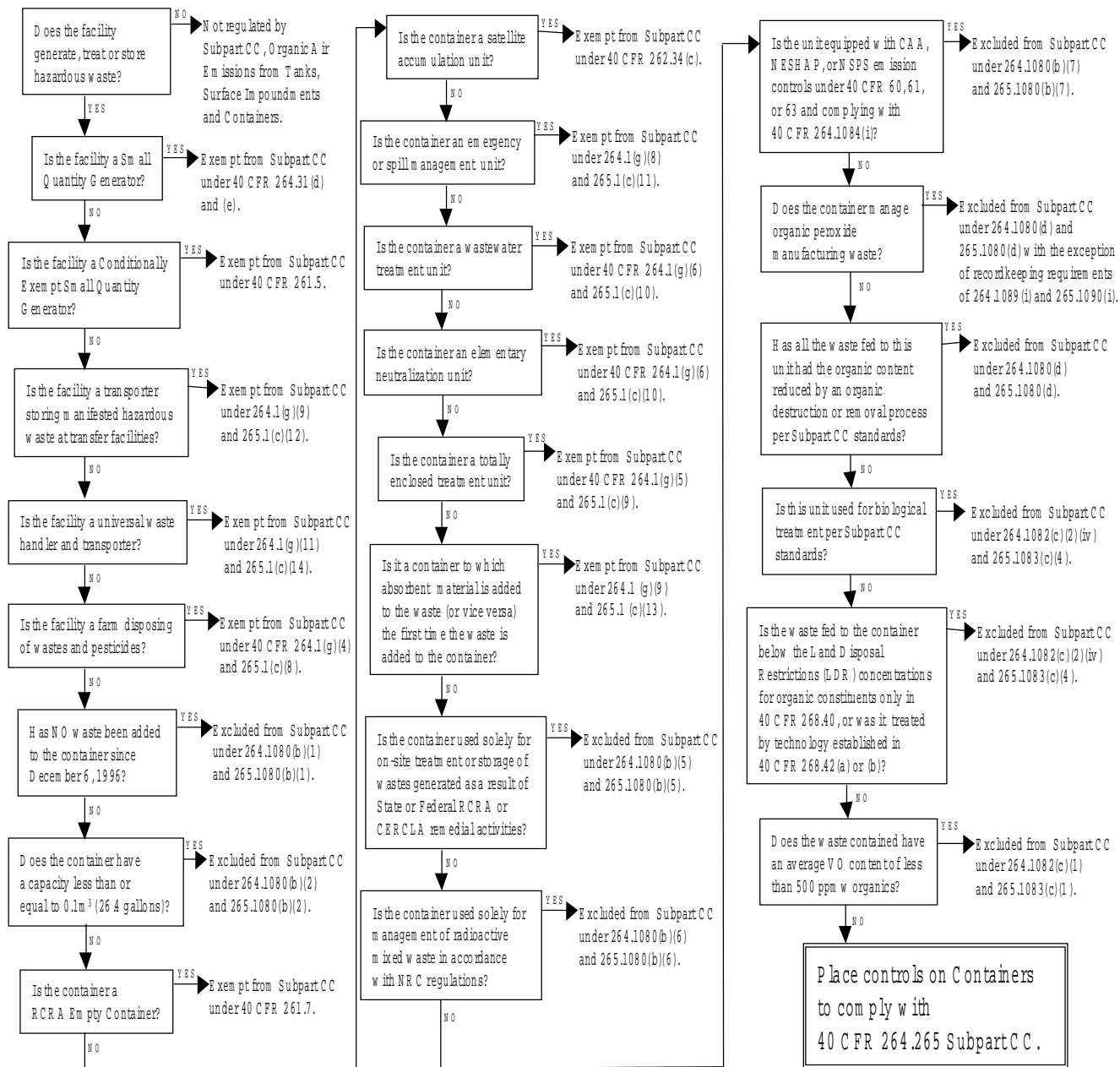
Figure 2-1: Applicability Decision Tree for Containers